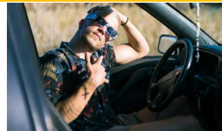
Croatia Baby Lasagna - Rim Tim Tagi Dim